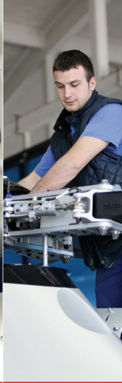
PROVEN WORLDWIDE SUPPORT