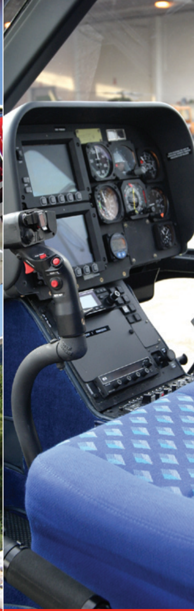
MORE VALUE FOR MONEY